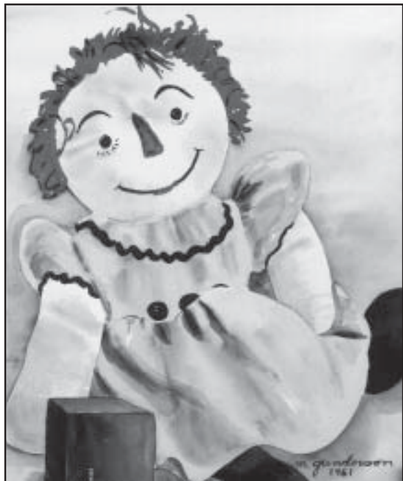
Raggedy Ann doll, 1961.