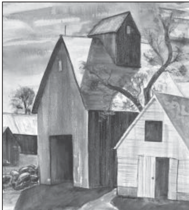
The Gunderson farm, 1952.

She had learned to use a computer through her work as a librarian, and in about 1985 bought an Apple IIe long before many of her children had computers. As an octogenarian, she uses it both for genealogical projects and correspondence with family and friends.