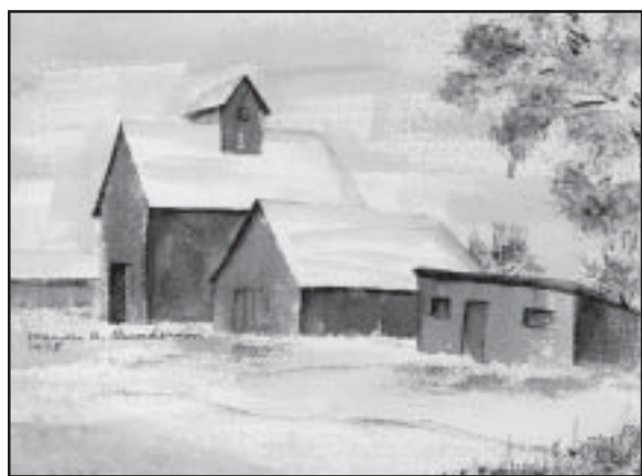
Gunderson farm, 1975.