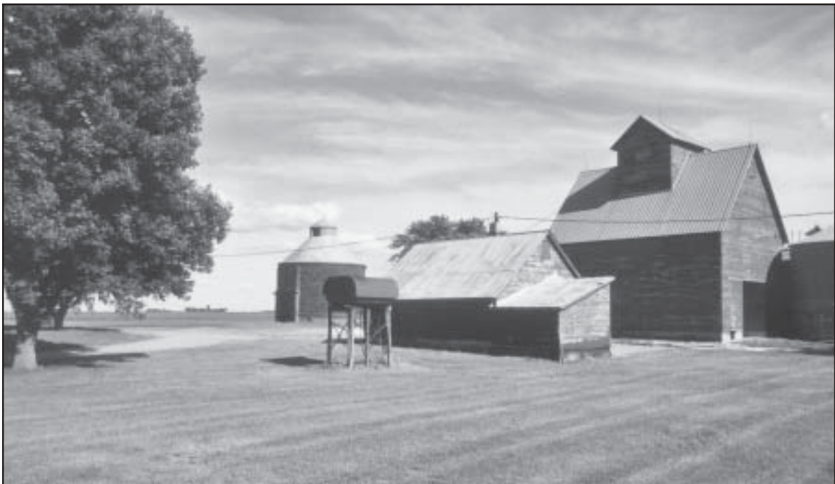
Gunderson farm buildings. Left to right: round brick corncrib, gasoline tank on posts, small building where Deane raised hogs, tall wooden corncrib, and metal grain bins, 2003.