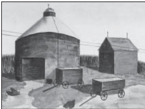
Gunderson farm, 1948.