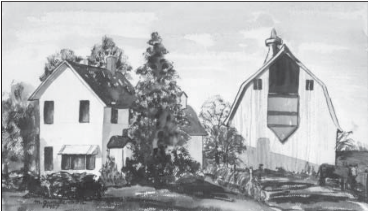
The Reigelsberger farm, 1957.