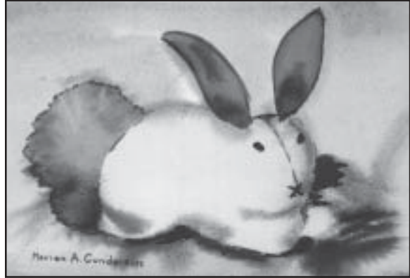
Bunny rabbit, date unknown.