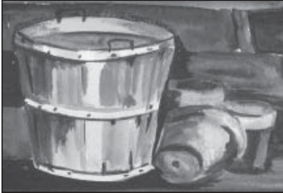
Bushel basket and clay pots, date unknown.