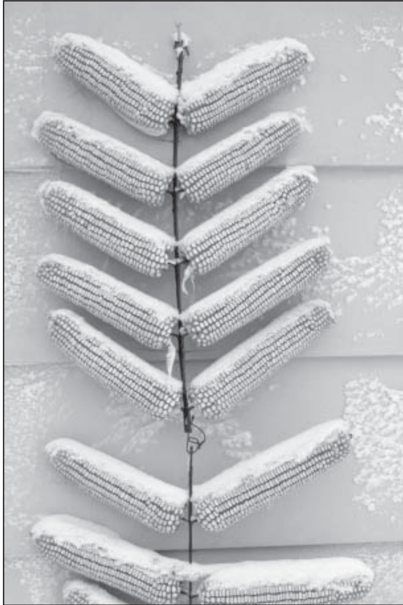
Snowflakes and ears of corn on an antique corn dryer that Marion used for decoration near the main entrance to her home, 1989.