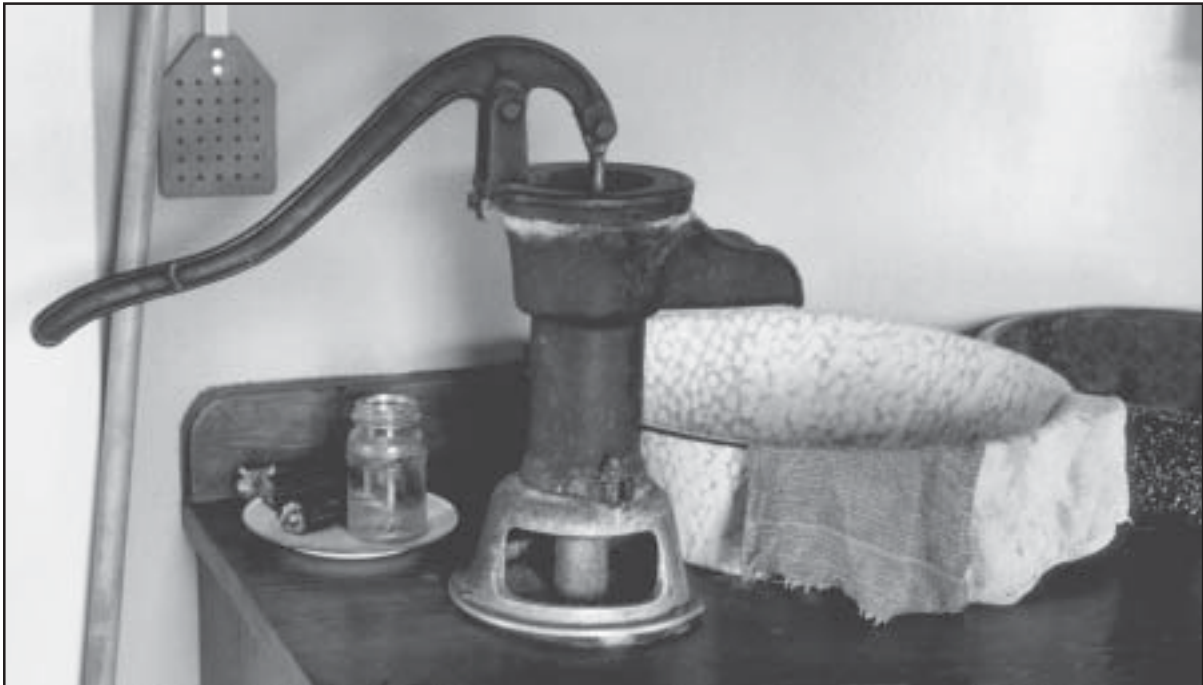
A kitchen washtub at Living History Farms, circa 1986.