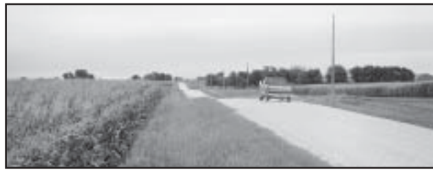
A pickup truck travels east along the road, 1995.