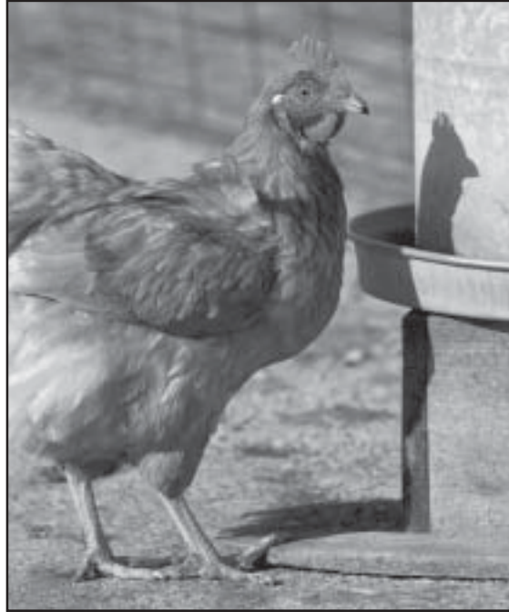
Chicken at water trough at the TJ Family Farms near McCallsburg, Iowa.