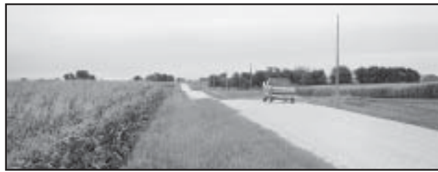
A pickup truck travels east along the road, 1995.