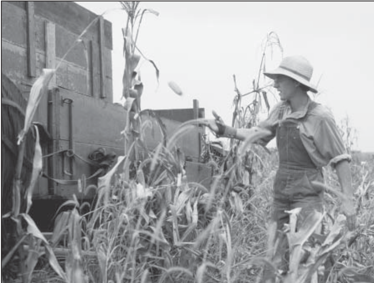
Harvesting corn at Living History Farms, 1986.

One of the great triumphs in my life was when I outshocked my dad in the oatfield, and when I outpicked him in the cornfield. He was pretty good!