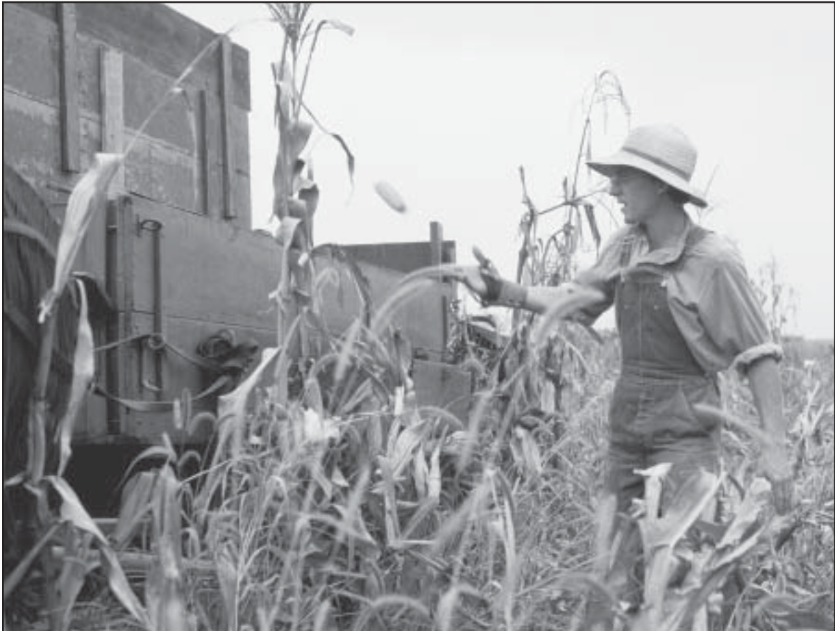
Harvesting corn at Living History Farms, 1986.

One of the great triumphs in my life was when I outshocked my dad in the oatfield, and when I outpicked him in the cornfield. He was pretty good!