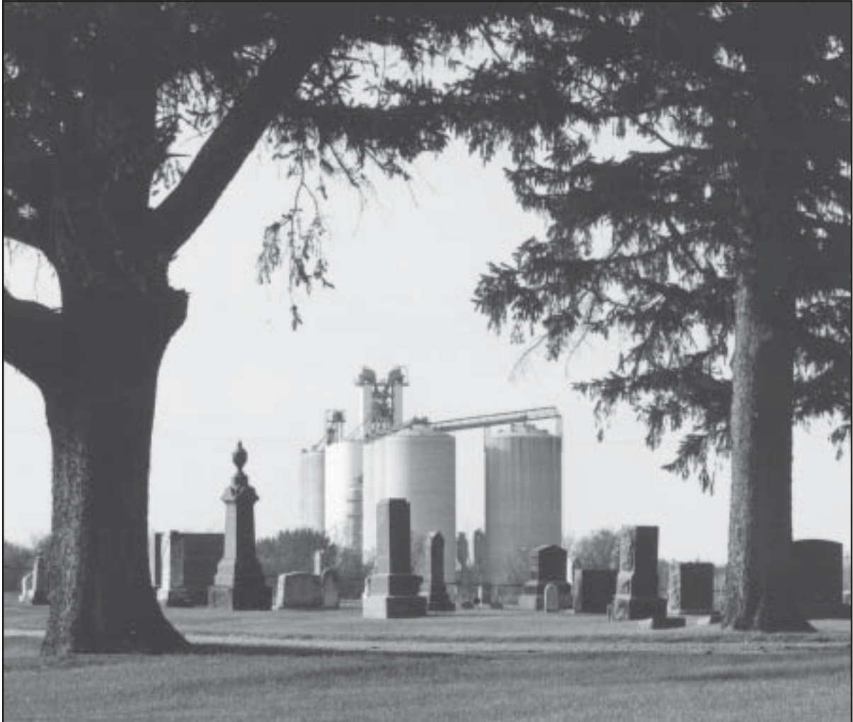
The old section of the Clinton-Garfield Cemetery southeast of Rolfe. The Pro Cooperative grain elevators are in the background, 2000.

From the yet to be published book The Road I Grew Up On: Requiem for a Vanishing Era All rights reserved. Helen D. Gunderson, 2004. www.gunderfriend.com