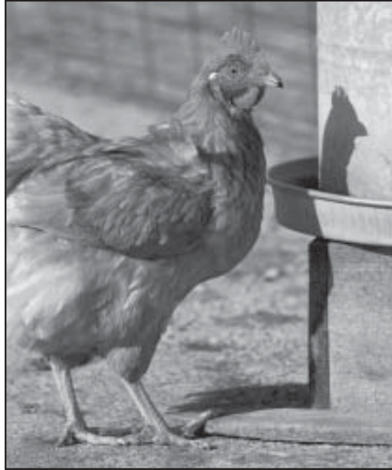
Chicken at water trough at the TJ Family Farms near McCallsburg, Iowa.