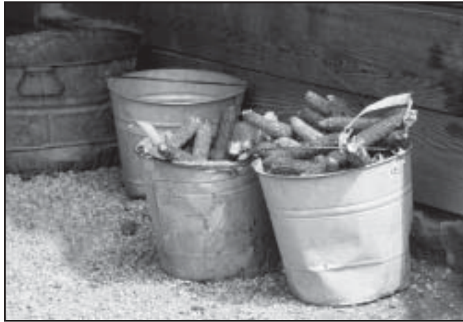
Buckets of corn cobs at Living History Farms, 1986.